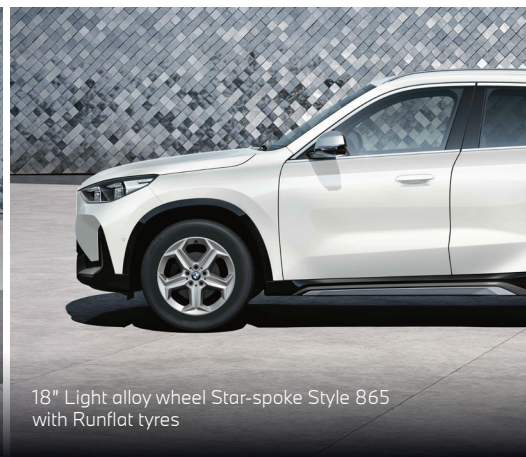
18" Light alloy wheel Star-spoke Style 865 with Runflat tyres