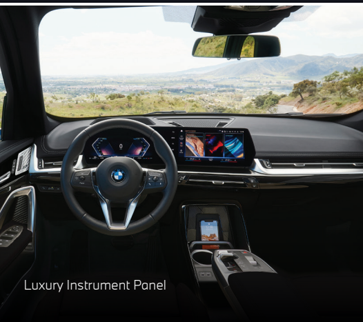
Luxury Instrument Panel