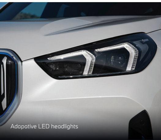
Adaptive LED headlights

Car specifications may vary from the model shown. Options and features available are model-dependent.