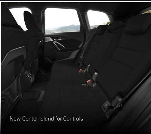
New Center Island for Controls